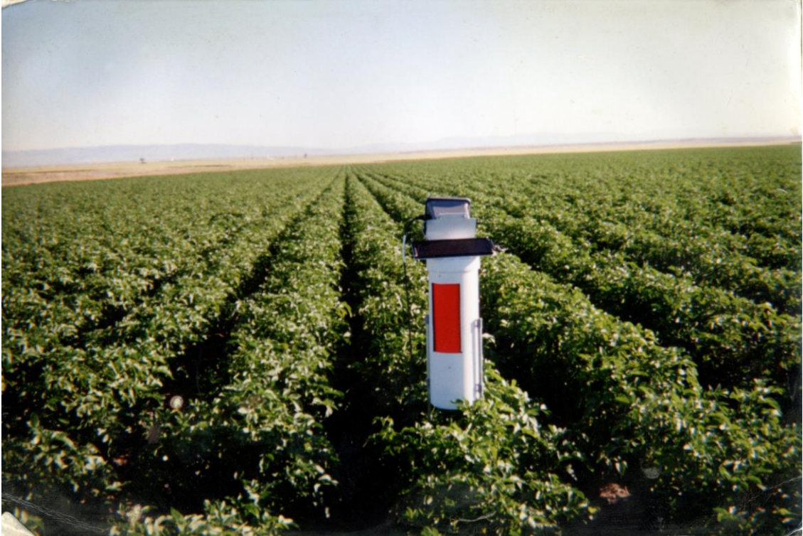
A potato field with adequate moisture, but one red Flag shows that an irrigation event is near.

Red colored Flags indicates driers soils of 75% ASM or less.