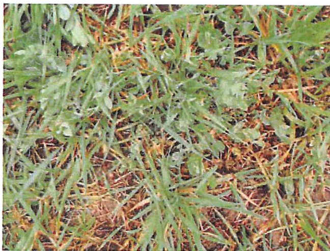
Figure 5. Austrian pea and winter wheat blend in early spring, Shoshone, Idaho.

When relying on cover crops as an N source, growers often search for simple tools to help them to predict how much N they can expect to be released from the plowed-under plant material. One useful tool currently available to growers is the OSU Organic Fertilizer and Cover Crop Calculator available at smallfarms.oregonstate.edu/calculator/ . The calculator was created to allow Oregon growers to quickly and easily predict N availability from green manure crops based on tissue N content, total biomass, and dry matter content. While a similar cover crop calculator is currently being developed for Idaho conditions, the Oregon calculator may be used to provide a rough estimate of how much N will be released from a cover crop that has been plowed under. The Idaho cover crop calculator will be completed and available online starting in September 2013.