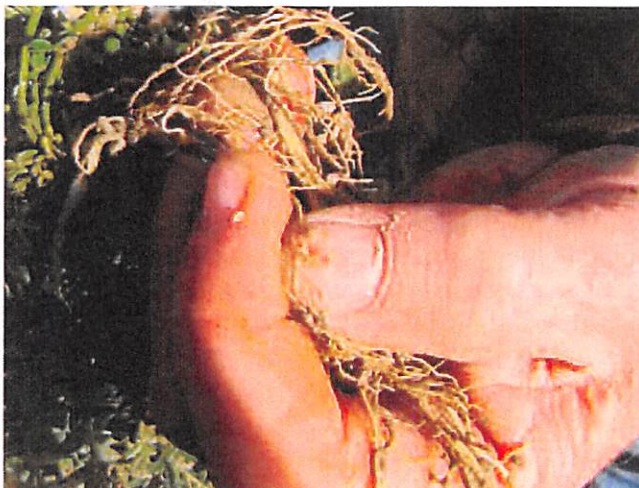
Figure 2. Pink coloring in dissected legume root nodules of hairy vetch at Aberdeen, Idaho, indicates an active population of N-fixing rhizobia bacteria.

Many organic growers in the Magic Valley have had success maintaining at least 50% of their cropland area in alfalfa for a minimum of 3 years in order to build nitrogen reserves as well as improve soil structure and organic matter content. Growers who are transitioning a field from conventional to organic production are required to follow organic regulations for 3 years before the field can be