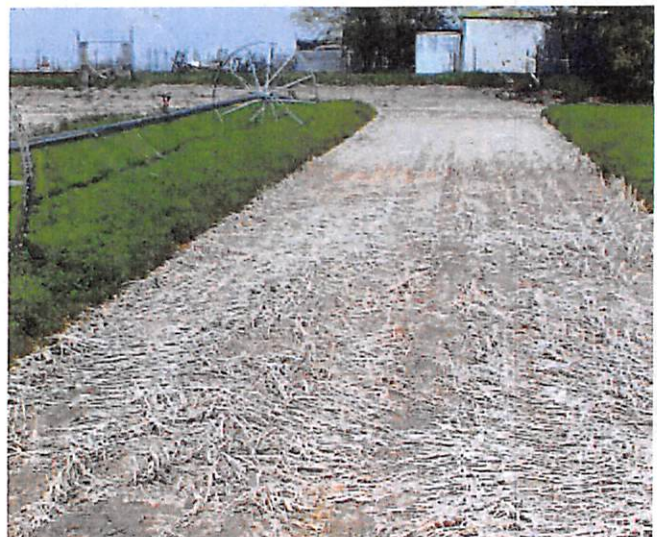
Figure 4. Mustard residue left over in early spring from winterkill, Aberdeen, Idaho. Note the lack of weeds growing on this plot.