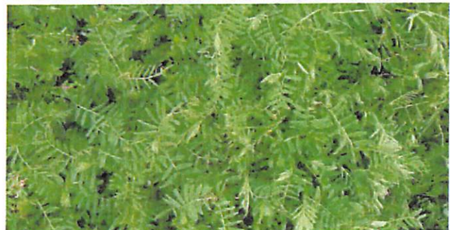
Figure 3. Austrian peas (top) and hairy vetch (bottom) are sometimes grown as winter cover crops in southern Idaho. Photos taken in mid-spring, Nampa, Idaho.